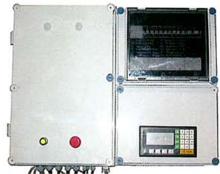
COMPUTER AND CONTROL BOX